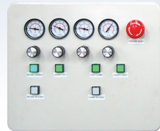
Connecting Rod Fixture Control Panel